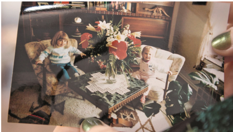
photo © Silke Schönfeld, ich darf sie immer alles fragen, 2023, DoF: Tommy Scheer